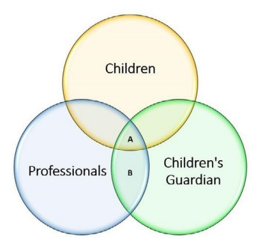
Figure 4 - Points of convergence between the perceptions of the three groups of interviewees. Brasília, DF, Brazil, 2021

The qualitative phase of the mixed methods study involved 32 participants, including 14 healthcare professionals, 11 caregivers, and 7 children. The healthcare professionals included 4 nurses, 5 physicians, and 5 physiotherapists. The caregivers consisted of 9 mothers of patients, 1 grandmother, and 1 father, aged between 33 and 60 years<sup>(5)</sup>. From the perspective of the three groups interviewed (parents, children, and health professionals), the aim was to identify points of convergence and divergence between the groups (Figure 4). Finally, the analysis allowed the synthesis and creation of the constituent elements of the video animation produced.